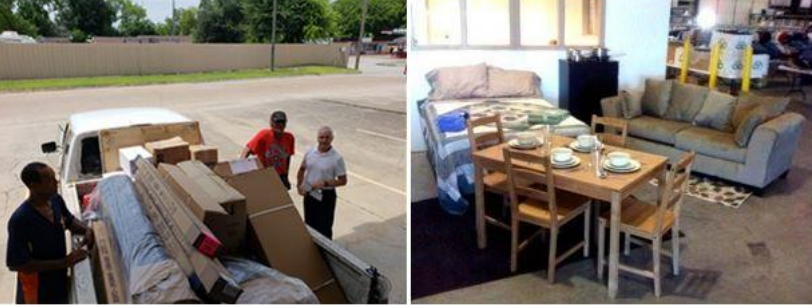
House in a Box: just one-step DSC takes in changing the lives of disaster survivors.