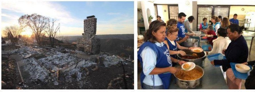
Home destroyed by California wildfires (Domestic disaster)